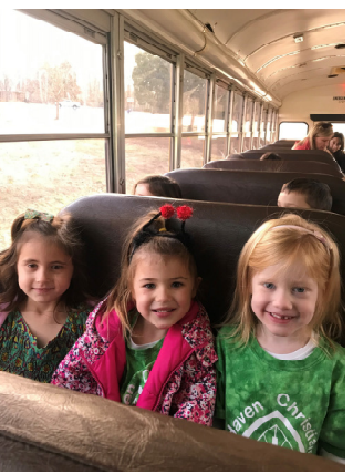
Tiny Tots Concert