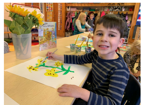
PHCP Art Show 2019