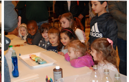
Super Dads Night!!