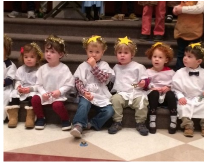
Christmas Program 2017